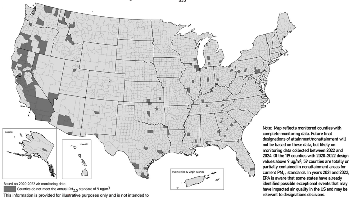
Figure 3. Most Counties With Monitors Already Meet the Strengthened PM 2.5 Standard