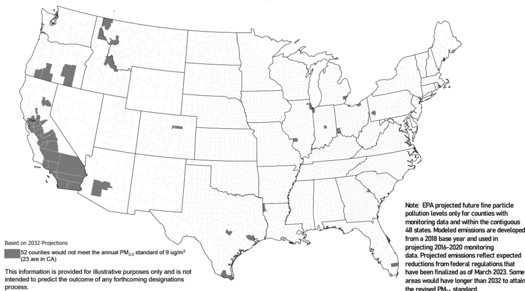
Figure 4. EPA Projects More Than 99% of Counties Would Meet the Revised PM 2.5 Standard as of 2032